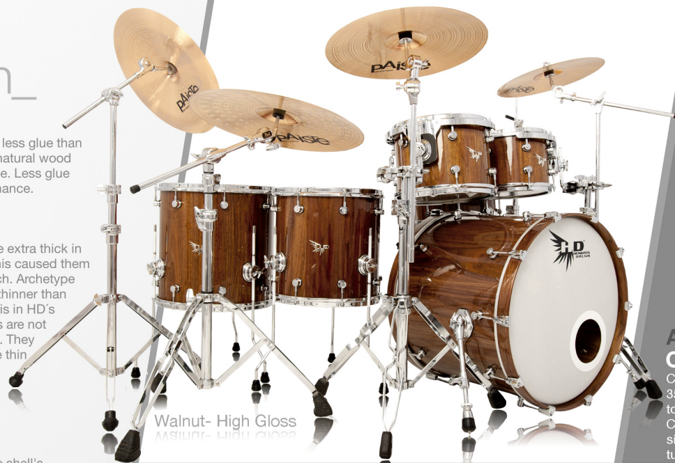
Walnut- High Gloss

One-ply drum shells are bent under a great amount of heat and pressure. This changes the internal structure of the wood grain and muddies the drum's tone as well as raising its pitch. Archetype shells are completely unstressed and in their natural state, thus producing the purest possible wood tone.